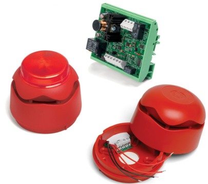
Vimpex's new Loop Sounder System components

Such systems consist of a Loop Controller Module and conventional sounders and sounder/beacons, which are fitted with bi-directional short-circuit isolators in their base. A module is installed between the standard sounder circuit and the sounder loop, being designed for DIN rail mounting within a wall-mounted enclosure. Such sounder loops can accommodate up to 45 sounders and multiple modules can be installed dependant on the size of system. All component parts should be approved by LPCB to relevant parts of EN 54 and such systems should be fully compliant with BS 5839-1 using a single sounder loop.