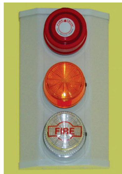
To aid the hearing impaired, the voice sounders have been installed alongside Fire-Cryer® twin strobe modules, which differentiate between alert and evacuation

Kettering General Hospital - Fire-Cryer® multi-message voice sounders have been installed in Kettering General Hospital as part of the facility's commitment to comply with the Disability Discrimination Act (DDA). The application of Fire-Cryer® voice sounders however, has done more than bring the site up to DDA standards. The project has transformed a traditional installation of bells and strobes to a much more sophisticated evacuation system with multi-messages, twin strobes and most importantly, a clear, unambiguous evacuation message for all. Each unit has been programmed with the bell tone which precedes the voice message to ensure compatibility with the rest of the site's fire alarm system. To aid the hearing impaired, the voice sounders have been installed alongside Fire-Cryer® twin strobe modules, which differentiate between alert and evacuation – amber strobe for 'Alert', Fire-labelled clear strobe for 'Evacuate'. Use of the Fire-Cryer's® special automatically generated 'All Clear' facility gives an automatic 'All Clear!' message once an alert is cancelled. The combination of the common bell tone, clear and unambiguous voice messages and twin strobes ensures that there is no confusion when building evacuation is required.