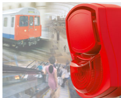
Fire-Cryer® Plus seven-message voice sounder with integral strobe