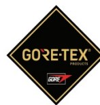
Waterproof + breathable lining membrane