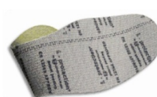
Flexible protective insole