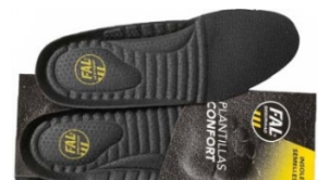
Removable Insole. Washable