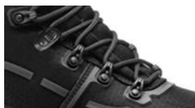
Non-metallic reinforced hooks.